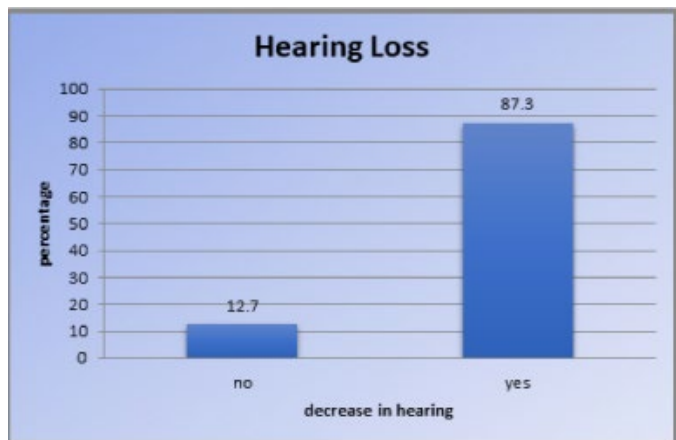
Figure 2: Distribution of patient on the basis of hearing loss.

Chi-square test, p=0.176, p>0.05 not significant